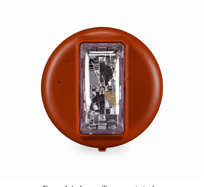
Figure 1: Indoor ceiling mount strobe